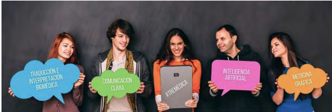
XIV Jornadas Internacionales de Traducción e Interpretación

It all began with the visionary idea of a physician, translator, editor, and the mastermind behind MedTrad, a Yahoo forum that united doctors and linguists passionate about English-Spanish medical translation. To maintain high-quality advice and support, the group decided early on to keep its membership fairly exclusive. This commitment to quality inspired members to create Panace@, an online journal dedicated to medical translation, and to establish Tremédica, an organization offering invaluable resources for medical translators.